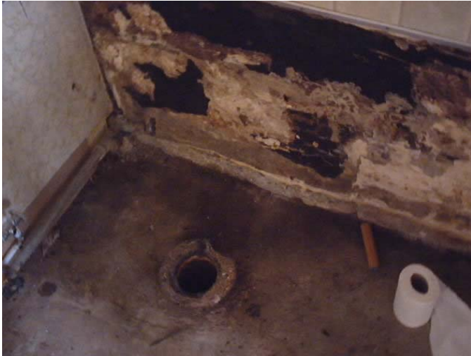
Re-position sewer line for ADA toilet

After years of discussion the lower level of the museum building has received a face-lift when Phase I was basically carried out in about three months in early 2004. The project was then put on hold until Phase II could be accomplished.